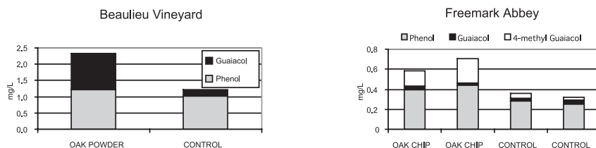
Figures 5 and 6: Smoke compounds in wine made with and without oak during crushing